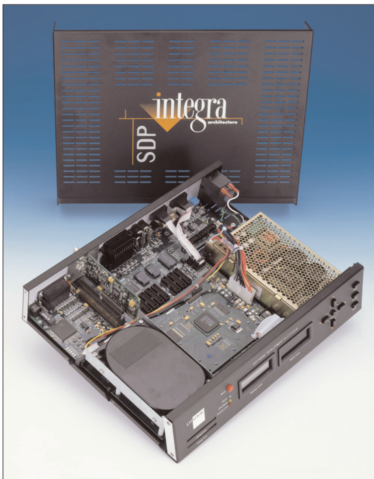
LSI Logic's Integra Set-top box Development Platform (SDP2005)