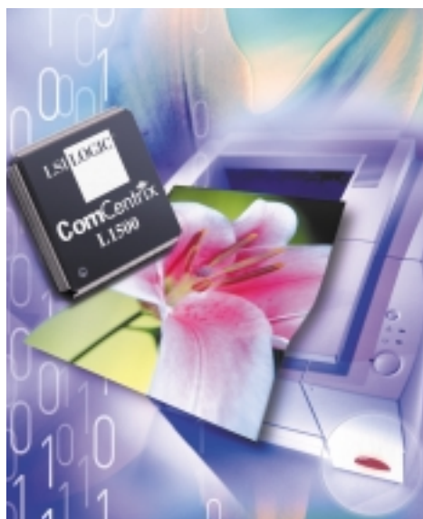
Standard product for peripheral I/O design

IEEE-1284 Parallel Port: IEEE 1284-1994 compliant bi-directional parallel peripheral interface with integrated DMA controller. Supports 1284-mode negotiation, device ID, compatibility (Centronics) mode, nibble mode, byte mode, EPP (enhanced parallel port) mode and ECP (extended capabilities port) mode.