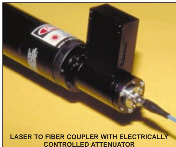
LASER TO FIBER COUPLER WITH ELECTRICALLY CONTROLLED ATTENUATOR