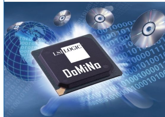
LSI Logic DoMiNo™ Network Media Processor