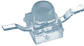
Absolute Maximum Ratings(Ta=25°C)